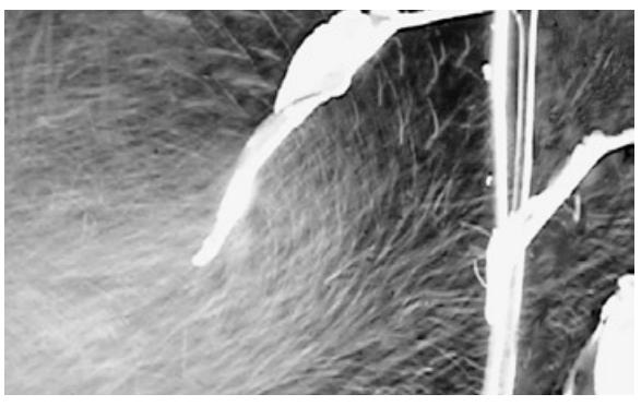
Air-assisted electrostatically charged spray defies gravity and wraps around leaves and stems, places that chemicals dispensed from hydraulic sprayers will never reach.

Growers are now faced with reducing their dependency on highly toxic pesticide materials. There is increased pressure to reduce runoff, pesticide overuse and worker exposure. The growing number of environmentally safe pesticide compounds available to growers are often weaker and very expensive.